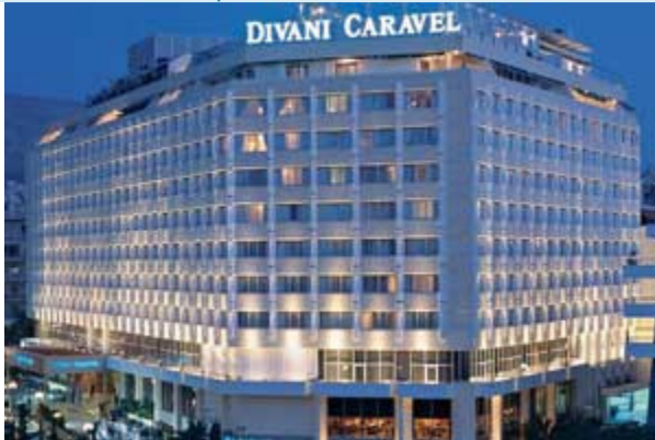
Divani Caravel, Athens

This deluxe hotel is located in the heart of Athens, near to the Embassy district.