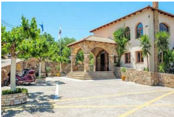
Europa Hotel, Olympia

This first class hotel is situated on a hill above the village of Ancient Olympia.