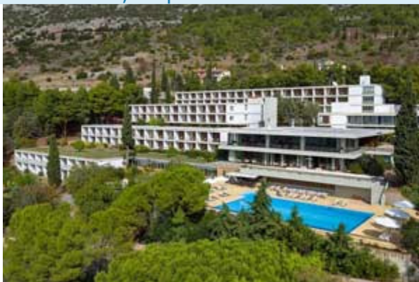
Amalia Hotel, Delphi

This first class hotel is located within walking distance of the town and main tourist attractions.